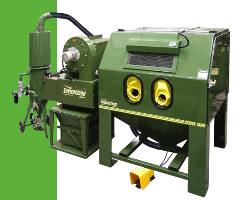
From Right: Pressure Cabinet; Dust Collector; Regrader & Blast Machine

Pressure feed hand blast cabinets are essential when removing heavy corrosion, tough coatings or when high production rates are required. Cleaning rates are up to 5 times the speed of a suction cabinet and are suitable for use with heavier, long life abrasives such as iron and steel. Pressure feed machines are commonly used in high production environments or on applications such as alloy wheel refurbishment and cleaning heavy castings.